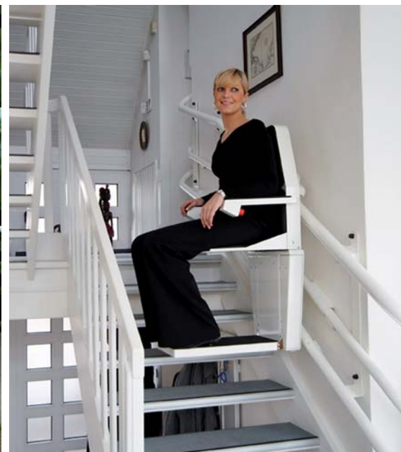
OMEGA seat version

Especially outdoors the OMEGA meets a solid, however shapely lift system.