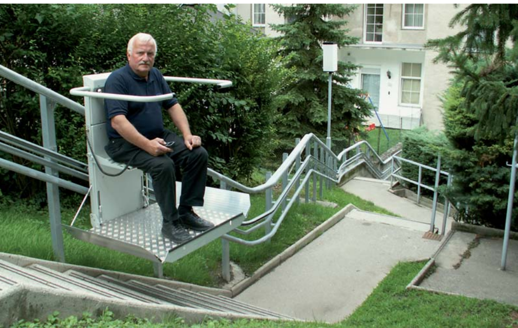
Even for longer courses across the garden the OMEGA is a very reliably lift.